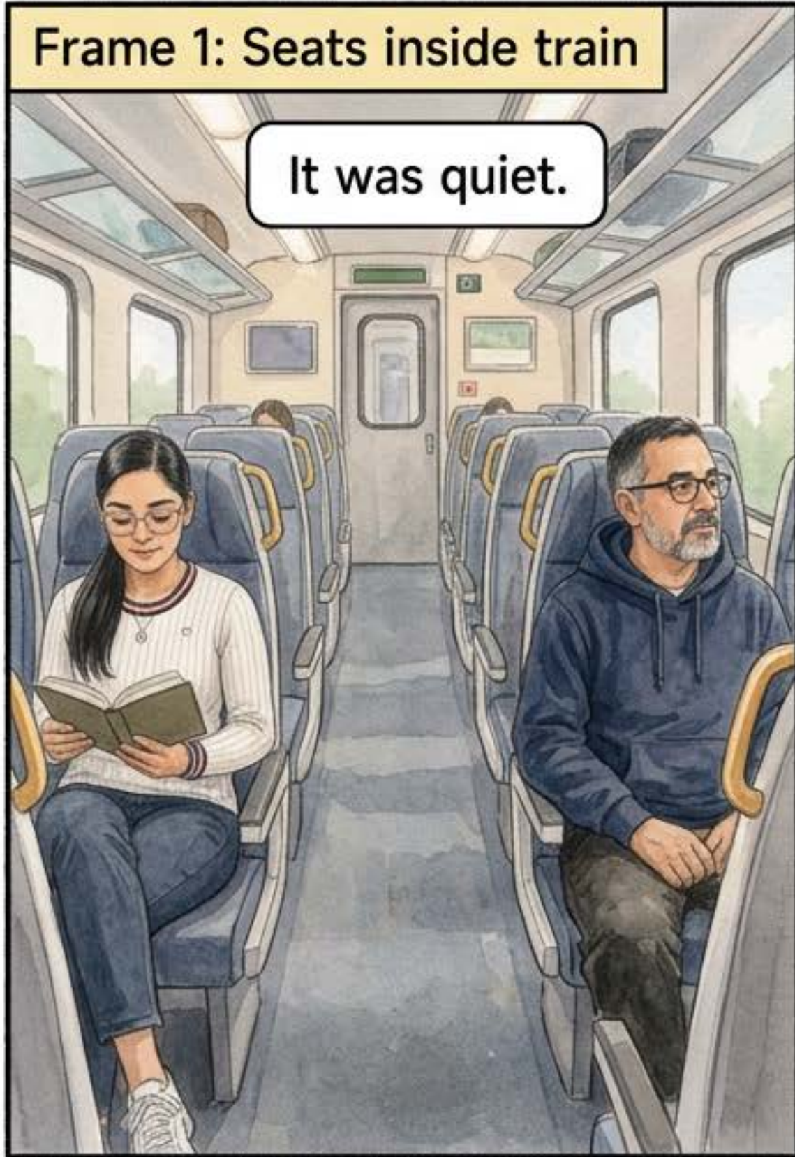
Frame 1: Seats inside train