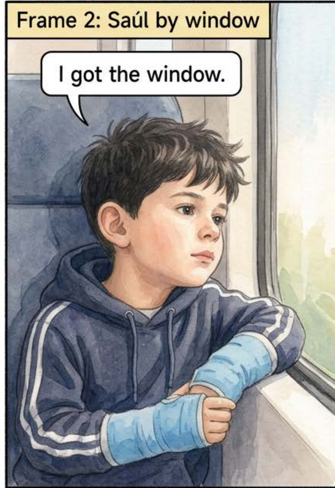
Frame 2: Saúl by window