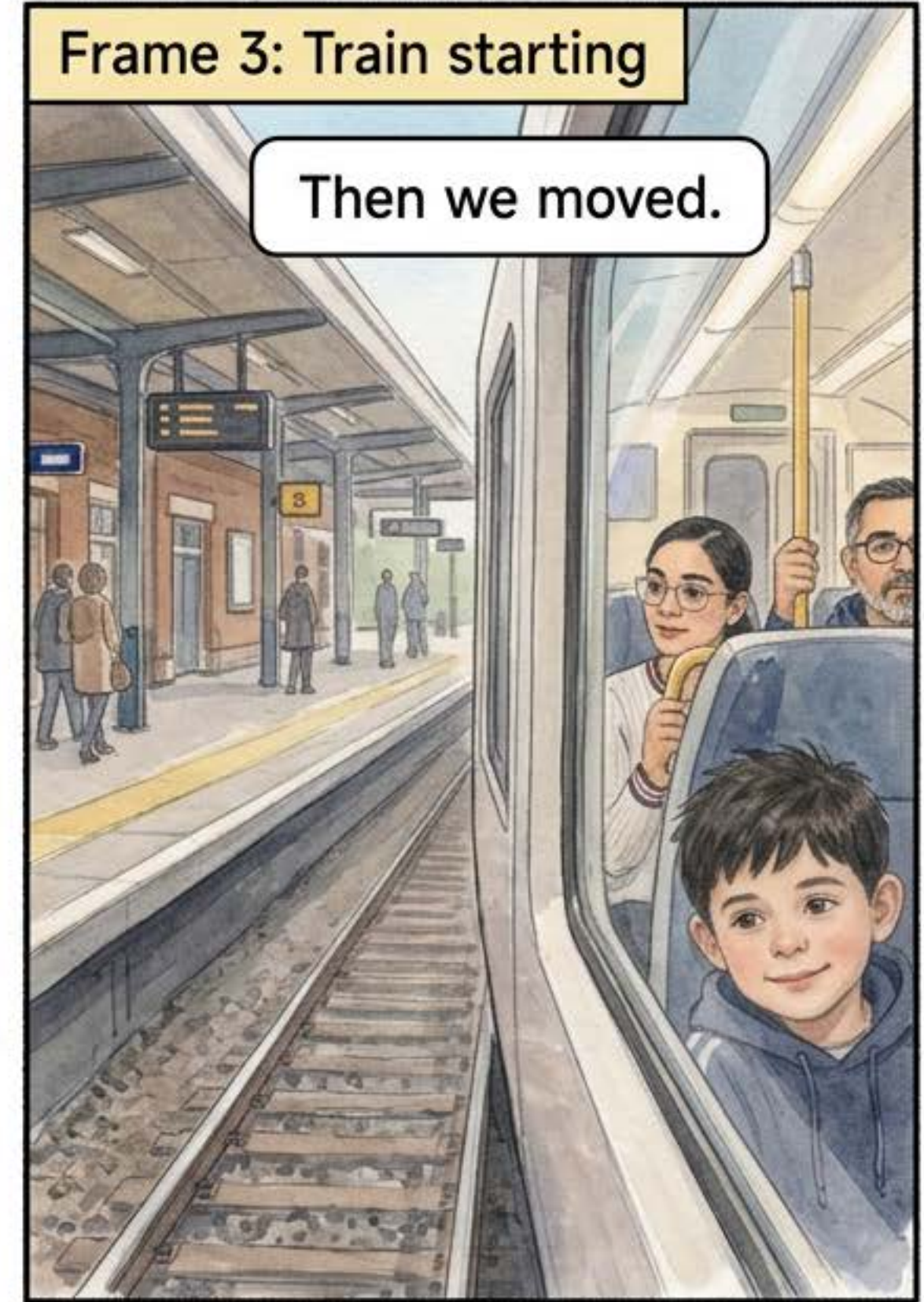
Frame 3: Train starting